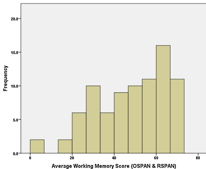
Figure 1. Histogram of average WM scores.